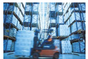
Product Recall Insurance