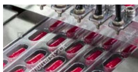
Topical & Consumer Health