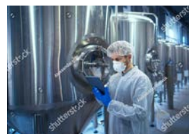
Contaminated Product Insurance

We pride ourselves on building long-term client relationships by providing comprehensive value, quick turnaround times and excellent service to our global client base that spans multinational manufacturers, distributors, assemblers, and wholesalers involved in the supply chain. AIG Talbot brings in-depth insights and leverages our experience across a wide range of industries, including: