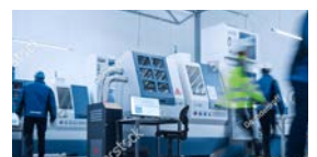
Component part manufacturers

*Through AIG-owned operations, AIG licenses and authorizations, and network partner insurers.